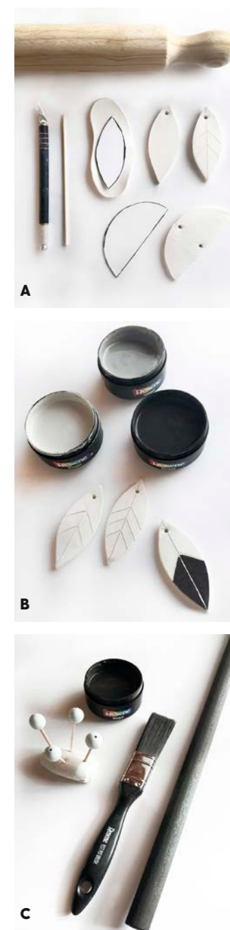
BACKGROUND PAINTED IN RESENE ETHEREAL.

Complete your look by painting an old planter to match. Give it a clean and a light sand, then use Resene Washi tape to help make those clean, straight lines before painting.