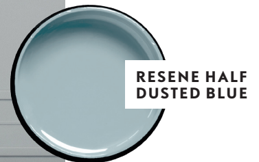
RESENE HALF DUSTED BLUE