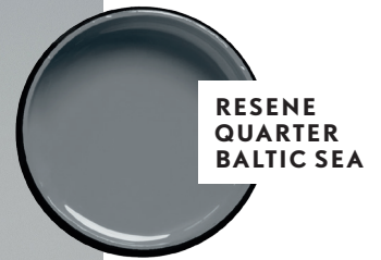
RESENE QUARTER BALTIC SEA