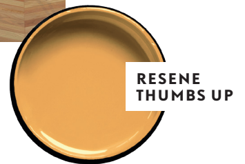
RESENE THUMBS UP