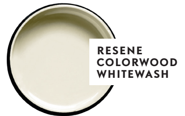
RESENE COLORWOOD WHITEWASH

F orget minimalism and its constraints. Make a move towards maximalism – one of the hottest styles in interior design. A blend of historical design and colours, layers and textures, and mixed artwork allows the maximalist to create an interior that not only melds the patina of time with contemporary decor but also creates an interior that is unique. “Maximalism allows you to let your imagination loose,” says Rebecca Long, Resene colour expert. “The key here is to connect the dots and play close attention to design elements, such as repetition and shape, to build your scheme.” Pairing colours is where it’s at: warm greys paired with tan, camel, terracotta and brown-blacks, for instance. Interior designer Debbie Abercrombie explains, “The combination of black on tan or tan on black is a smart choice. Also keep an eye out for ochres and colours of cracked earth. The key is seeing colour in combination. Colours isolated are often not the wow we are looking for. It is how we combine them.” See the latest colour trends in The Range fashion colours fandeck from Resene for fresh ideas for your home. When you’re choosing trends, remember the golden rule: always choose colours you love. That way you’ll enjoy them for years to come. The Resene colour collection includes the latest designer paint colours. Available from Resene ColorShops and resellers (resene.co.nz/colorshops or 0800 737 363). Please view a physical Resene colour sample before making your final choice.