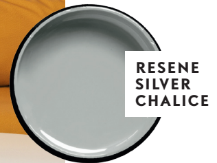
RESENE SILVER CHALICE