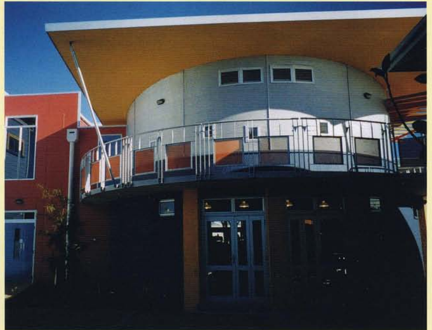
▲ Hume Architects' $1.6m new education complex for Carncot Independent School.

Somewhat futuristic in appearance, this new centre captures the imagery of the next century with its satellite appearance, which is enhanced by the use of the new Resene metallic finishes.