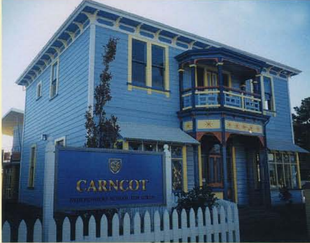
▲ The public face of the school is known as 'Painted Lady'.

A palette of Resene colours has been used to inject excitement and stimulation for the 160 students at Carncot Independent School in Palmerston North. The original circa-1900s two-storey building has been moved from the rear of the grounds to the roadside, providing an historical facade. It is fondly known as the 'Painted Lady' - a term relating to her age, ornate and decorative features, along with the vibrant and lively colour scheme. The project includes eight large classrooms for primary to intermediate girls, and a circular two-storey stand alone building with a butterfly roof that houses the technology centre, library and art space.