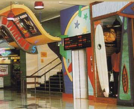
Interior of the new extensions in North City.

... downtown shopping complex in Porirua have ... shopping complex in New Zealand. ... undertaking costing around $24 million to build. ... extensively to decorate 30 new retail shops, an ... as, a stand alone supermarket, a themed ... and a repaint of the existing K Mart. ... comprised Resene Sureseal overcoated with ... superior finished in Lumbersider over two coats ... roofing and texture.