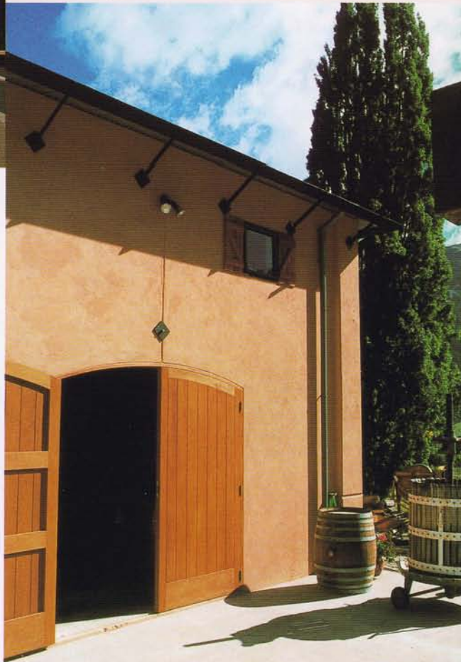
Mount Edward Winery's two-tone exterior finish enhances the building's Tuscan style.