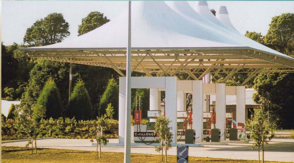
New Challenge Service Station in New Plymouth.