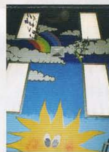
Night and day, young patients are cheered by this mural at Waikato Hospital.