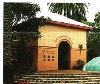
The rainforest portal at the Auckland Zoo, painted with Resene.