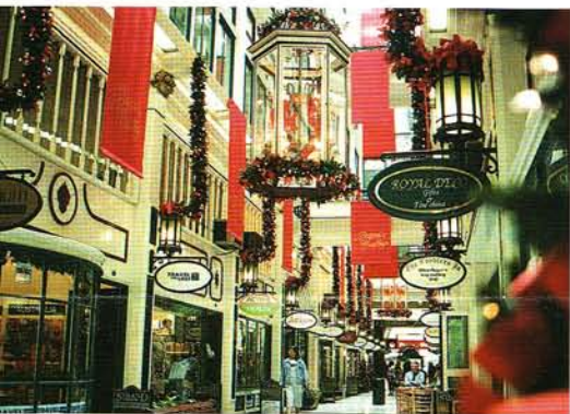
Queen Street's Strand Arcade – restored to classic heritage ambience.

"The silicate in the paint – which is as hard-wearing and easy to apply as standard formulations – gives it depth and an attractive texture," Neil says.