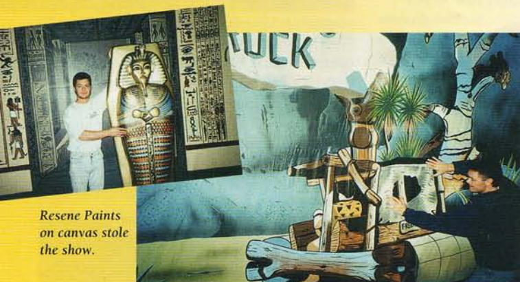
Resene Paints on canvas stole the show.