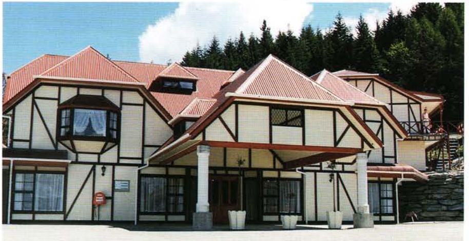
Sherwood Manor Motel.