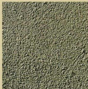
Sponge plaster finish.

The Ebor Street Apartments in Wellington is the first building in New Zealand to feature Resene Plastercote in a specially mixed colour.