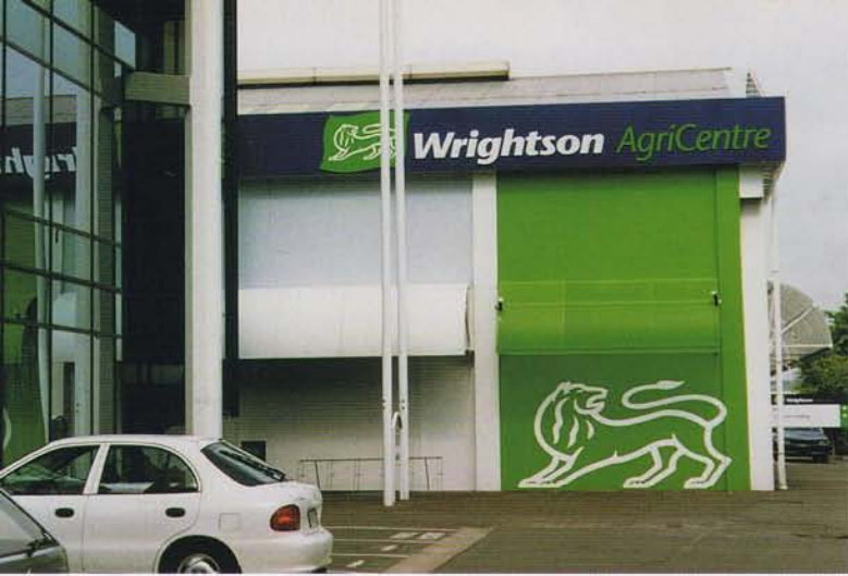
▲ Wrightson's AgriCentre on Deans Avenue in Christchurch.