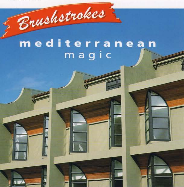
▲ Ebor Street Apartments capturing the Mediterranean look.