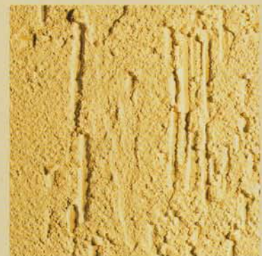
Scratch plaster finish.

A levelling coat of Resene Plastercote Base has been applied to the exterior concrete block followed by a topcoat of Plastercote applied with a hopper gun and finished with a 12 inch wooden trowel to create a subtle Mediterranean effect. A two-coat application of Resene Plastercote was applied to the Harditex highlighting the extensive exterior detailing.