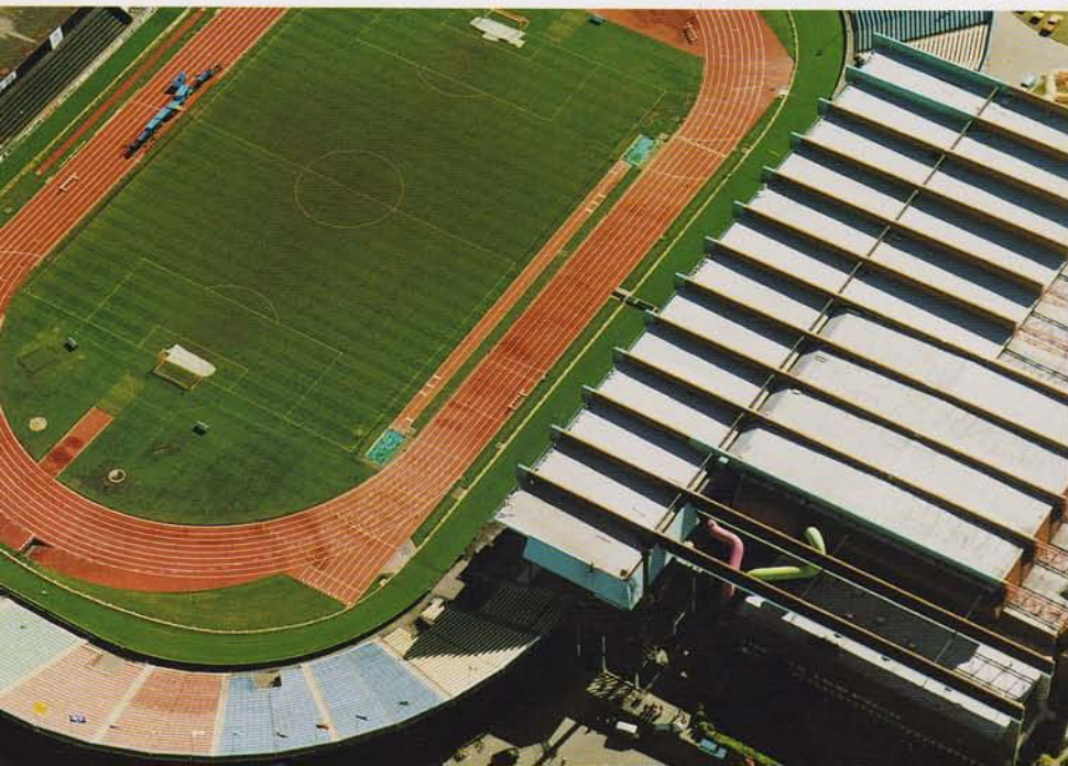
▼ Aerial view of the QE II Stadium in Christchurch.