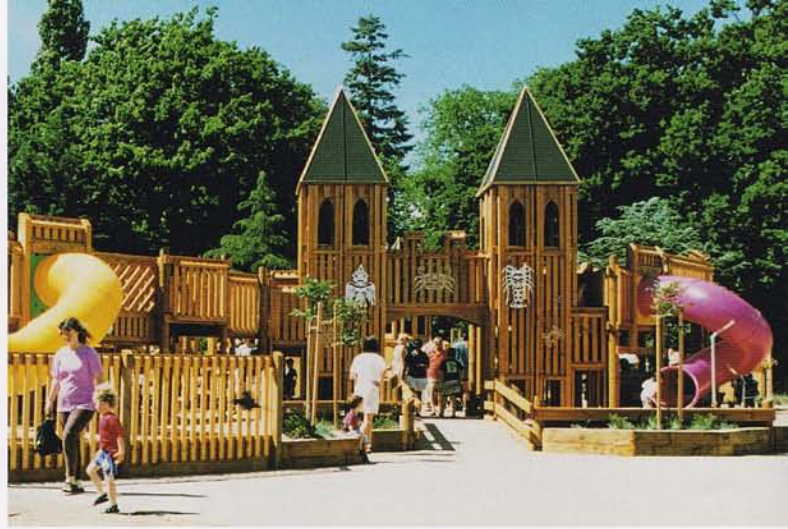
▲ 'Kids Own Playground' - built by the community for the community.