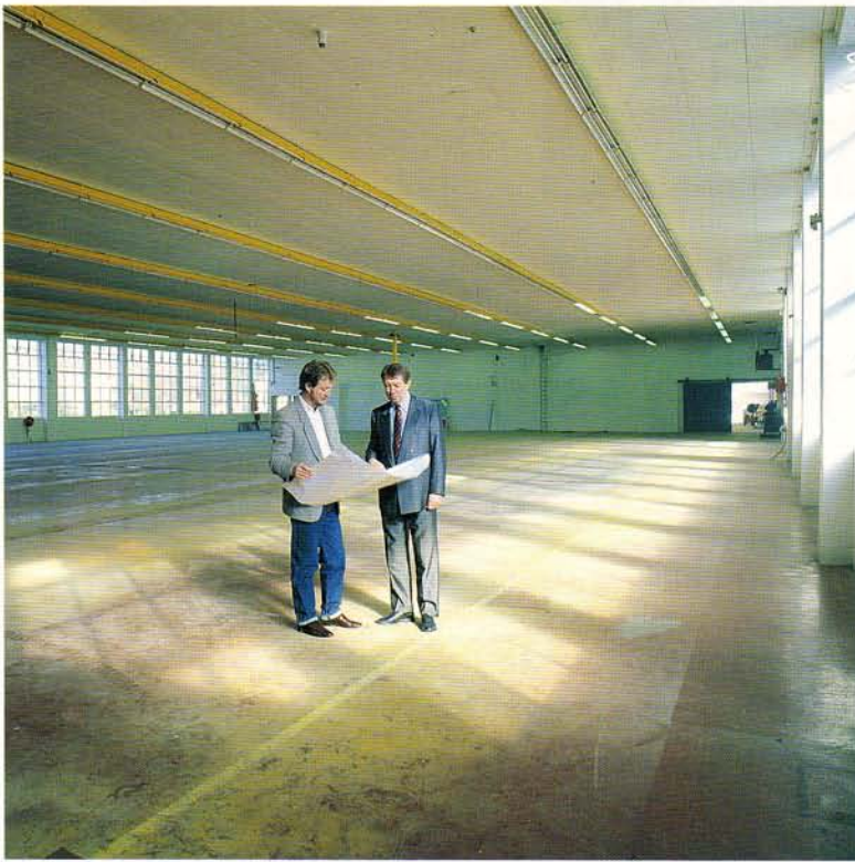
The new warehouse area will have the capacity to hold much increased volumes of Resene Paints' products.