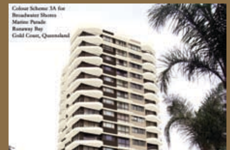
Resene RenderRite electronic rendering service visual