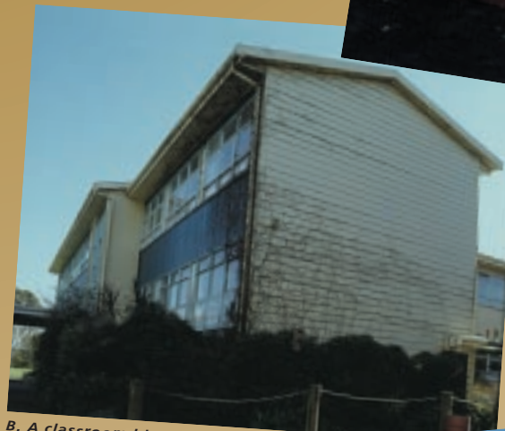
B. A classroom block before repainting.

Inside, subdued tones of hessian, pastels and varnished wood have given way to a sumptuous palette of refreshing Resene colours selected from a range of Resene Environmental Choice paints providing a safer environment for both pupils and staff. Resene Zylone Sheen has been used on the walls and ceilings, while Enamacryl waterbased enamel has been used on doorways and other trim work for its hardwearing properties.