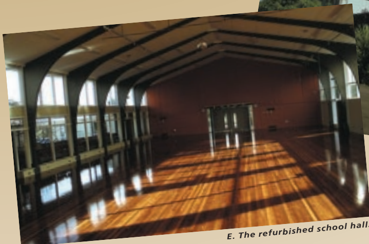
E. The refurbished school hall.