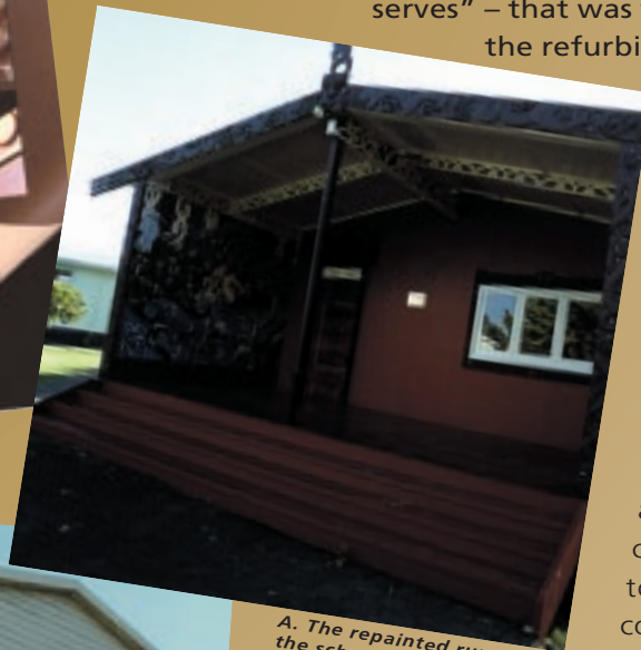
A. The repainted rumaki on the school marae.

“Fresh and expressive of the multi-cultural neighbourhood it serves” – that was the image arising out of a brief for the refurbishment of Western Springs College with the help of Resene Paints.