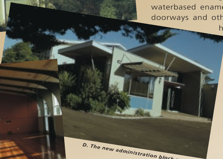
D. The new administration block extension.