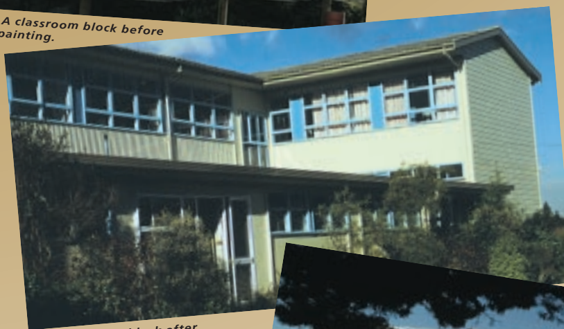
C. A classroom block after painting.