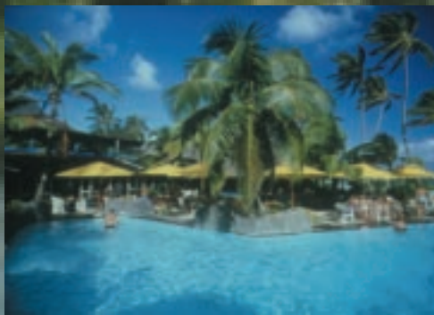
This is the life at the recently refurbished Rarotongan Beach Resort in the Cook Islands.

Painting contractors Arama & Associates used Resene Lumbersider on most of the exterior surfaces and Enamacryl and Lustacryl waterbased enamels on the trim, allowing visitors to relax as usual without experiencing unpleasant paint fumes.