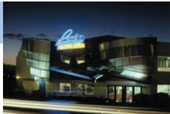
Skate blades and a goalie's mask add to the ice theme at the Paradise Skating Arena.

The exterior system used was a combination of Resene X-200