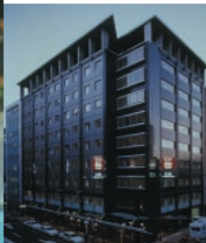
The Ibis Wellington captures character and atmosphere painted in Resene Metallics.