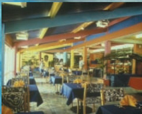
A palette of vivid Pacific colours used in the restaurant gains from the natural surroundings.