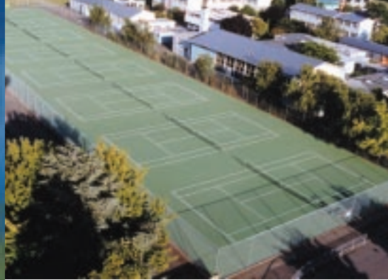
Aerial view of the resurfaced tennis courts at Marlborough Girls' College.

Because this coating is easy to apply, Marlborough Girls' College used volunteers from the Marlborough Tennis Club to complete the job. Resene Membrane Roofing Primer was used as a first coat to seal the asphalt surface. This was followed by two coats of Resene Tennis Court Coating, applied using a squeegee attached to a pole, and Lumbersider for the lines. Resene Tennis Court Coating can be applied over asphalt or concrete and is available in two different colours – green and terracotta.