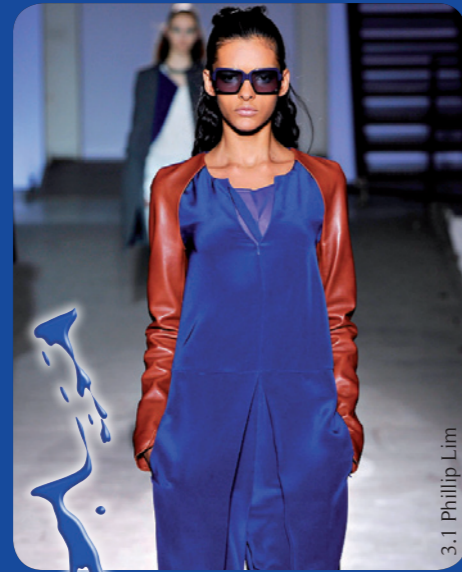
3.1 Phillip Lim