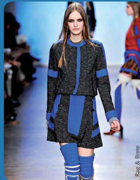
Rag & Bone

Resene Breathless is a cool blend of blue, lilac and grey with an inspirational and airy ambiance. Used alongside peachy pinks and pale pistachio green, floor-length dresses in Resene Breathless set a dreamy note in Missoni's fairytale-inspired runway show.