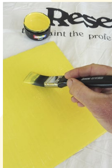
Step five Paint the other side of the cardboard with Resene Bright Spark and allow to dry. In the same way, apply a second coat of Resene Bright Spark to both sides of the cardboard and allow to dry.