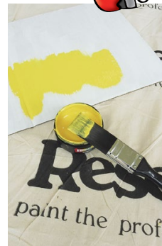
Step four Paint one side of the cardboard with Resene Bright Spark and allow to dry.