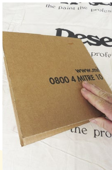
Step one Fold the piece of cardboard in half, as shown.