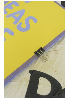
Step eight Place the small bulldog clip on the edge of the file to keep it shut. Now get thinking!

Create your very own ideas file where you can store notes, drawings, clippings and even photographs.