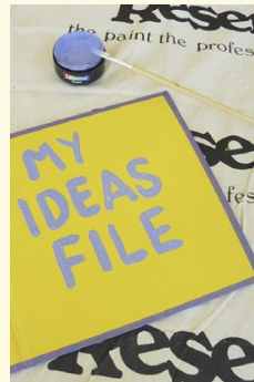
Step seven Paint 'My Ideas File' on the front of the file using Resene Reverie and allow the paint to dry.