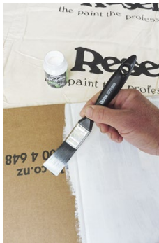
Step two Apply one coat of Resene Art Action Quick Dry to one side of the cardboard and allow to dry.