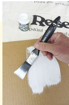
Step three Apply one coat of Resene Art Action Quick Dry to the other side of the cardboard and allow to dry.