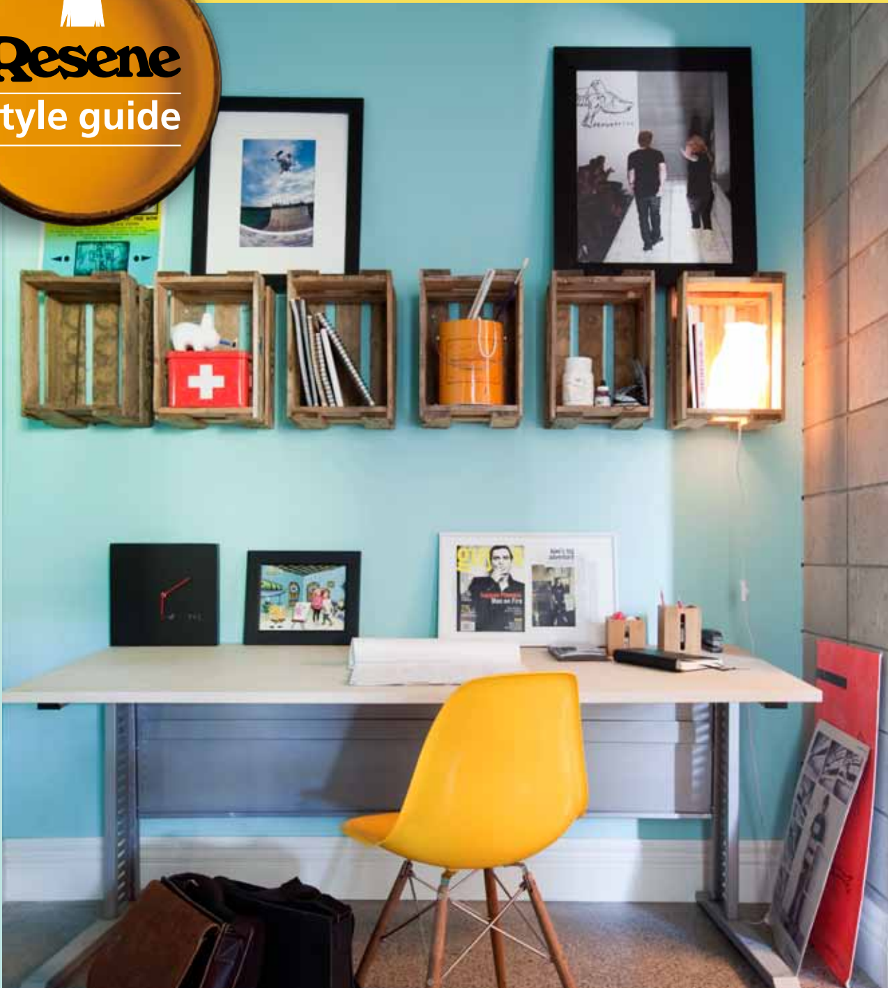
Get the look: Resene Scandal, Resene Half Bianca