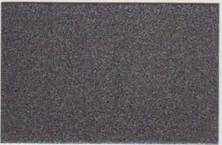
Blast Grey 2™ (Tundora) M44-006-075