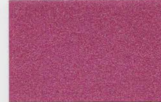
Bedazzle™ (Rouge) M54-081-355