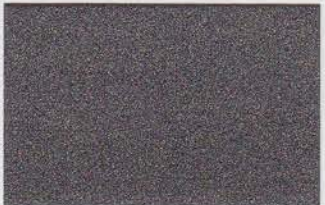
Deep Space™ (Masala) M51-009-077