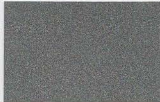
Magnetic™ (Raptor) M46-016-114