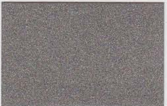
Pure Pewter™ (Chicago) M60-015-085