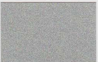
Proton™ (Copyrite) M80-013-107