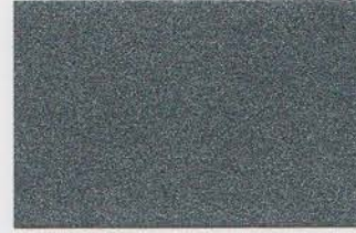
Pioneer™ (Espirit) M46-015-178