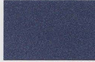
Sputnik™ (True Blue) M37-031-265