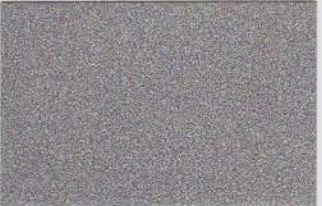
Aluminium™ (Stack) M71-005-087