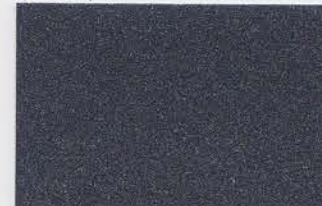
Pearl Shimmer™ (Nero) M36-007-258