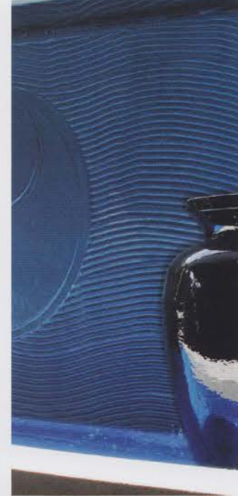
Resene Zoop De Loop