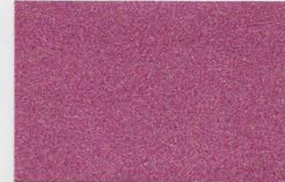
Enchanted™ (Rouge) M60-078-344