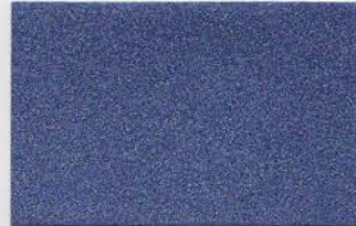
Time Warp™ (Astronaut) M49-055-264