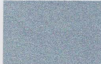
Scotty Silver™ (Shinto) M76-026-239