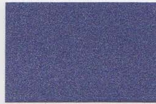
Digital Blue™ (Astronaut) M40-046-279