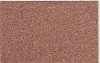
Magma™* (Root Beer) M59-074-060