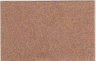
Bullion™* (Porsche) M67-080-068