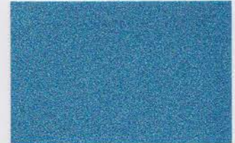
Zoop De Loop™ (Tory Blue) M52-085-267