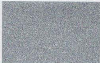
Infinity™ (Regent Grey) M67-010-213