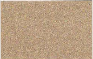
Blast Yellow™ (Quasar) M48-058-063