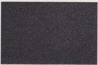
Blast Grey 1™ (Shark) M34-004-071