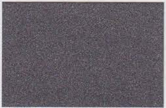
Basalt™ (Zulu) M43-005-325