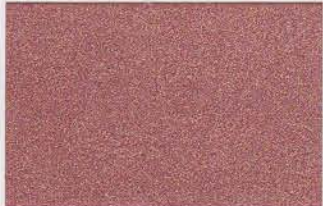
Copper Fire™* (Wild West) M57-064-045