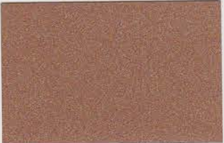
Copper Fire™* (Wild West) M57-064-045