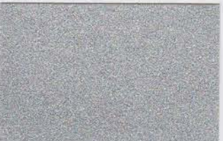
Silver Aluminium™ (Silver Chalice) M83-003-232