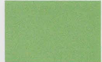
Go Go Go™ (Anise) M73-080-131

A basecoat is recommended for all Resene Metallics and special effects colours. The recommended basecoat is shown in brackets after the colour name. Resene Pearl Shimmer may be applied over a variety of basecoat colours for different effects. It is shown here over Resene Nero.