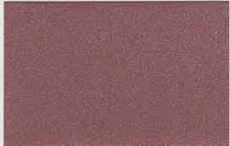
Copperhead™ (Lumberjack) M47-038-039