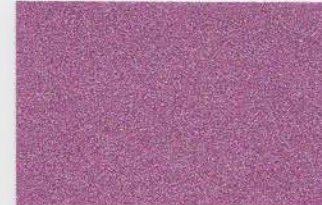
Sugar And Spice™ (Strikemaster) M67-062-336