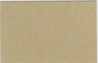
Gold Dust™* (Apache) M69-066-078