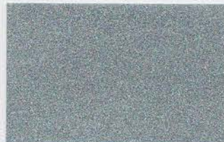
Obelisk™ (Blue Smoke) M64-015-199