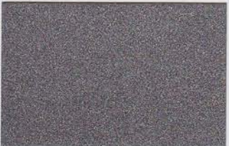
Blast Grey 3™ (Friar Grey) M55-002-072