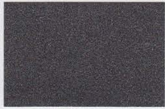
Catch 22™ (Zeus) M35-004-106