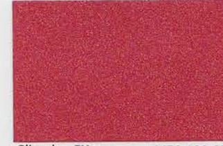
Glitterbug™ (Pirate) M50-100-022