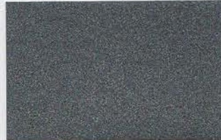
Mica™ (Mangrove) M37-011-188