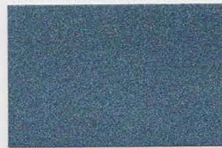
Lucifer™ (Teal Blue) M40-037-226