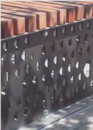
Resene Blast Grey 3