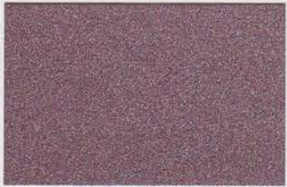
Galaxy™ (Cosmic) M50-027-007