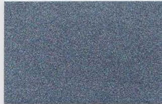
Dalek™ (Kashmir Blue) M46-028-246