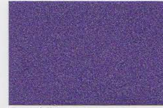
Funtasia™ (Daisy Bush) M48-091-301