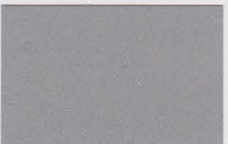
Silver Steel™ (Half Stack) M67-001-338