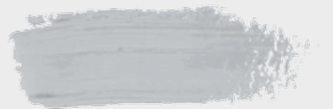
RESENE Triple Athens Grey