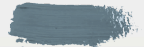
RESENE Blue Bayoux