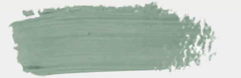
RESENE Sorrento (on walls)