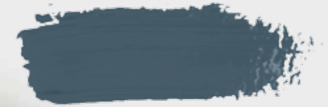
RESENE Half New Denim Blue