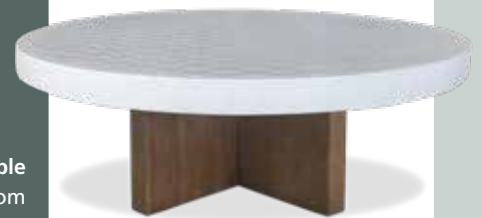
illustration Malcolm White

Mosaic Coffee Table Freedom www.freedomfurniture.co.nz 0800 469 327