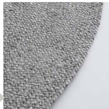
illustration Malcolm White

Tairua Silver Birch Floor Rug Furtex www.furtex.co.nz 0800 333 456