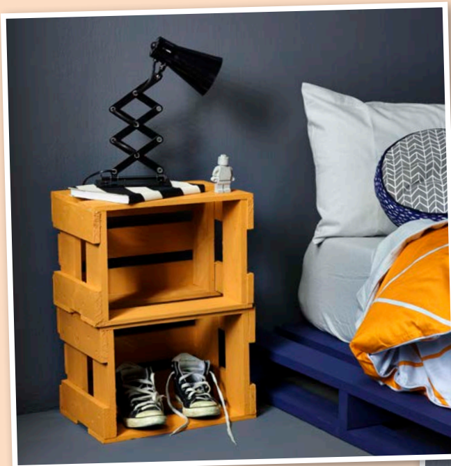
This page and opposite Hexagon Trenton wire shelf, set of three $59.90, from Bed Bath & Beyond; dog's tail orange hook, $7.99, from Shut The Front Door; pull light, $16.99, from Bed Bath & Beyond; Think Outside The Box A3 print, $22, from Simply Creative; Adventure A4 print, AU$15, from toucanonline.com; grey flannelette sheet set, $32, from Kmart; Aura Diamond reversible single duvet cover, $149, from Shut The Front Door; orange cross cushion, $69, from Perch Home; Do Not Disturb cushion, $19, from The Warehouse; General Eclectic round reversible cushion, $36.99, from Shut The Front Door; Aura Cross rug, $999, from Perch Home; wooden arrow, set of two $12, from Typo; elevator black lamp, $19, from Kmart; concrete Lego figurine, $12, from concretedesign.co.nz; dog greeting card, $7, from Junk & Disorderly; grey marle triangle cushion, $39.95, from Freedom; cross wood canvas, $6, from Look Sharp painted in Resene 'Smoke Tree'; crates, $30 each, from Junk & Disorderly; pallets, $75, from Mitre 10. Books, skateboard, headphones, shoes and sports trophies, stylist's own.

To create the paint effect on the wall, choose two colours and paint the whole wall in the lighter colour (we used Resene 'Jumbo'). Draw a faint pencil line across the wall 1.5-1.6 metres up from the floor. With a roller, roll the lower half in the darker colour (we used Resene 'Quarter Foundry') up to the line. Aim for the meeting point to be rough and uneven, which is easily created with a roller. Paint the floor in the same dark shade.