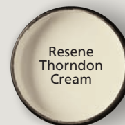
Resene Thorndon Cream

Focusing on the colours that are dominant to your style personality when developing a room scheme can help you put together interiors that feel right quickly and easily.