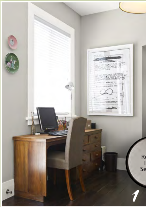
Resene Triple Sea Fog

you can get curtains designed to work with your paint from the Resene Curtain Collection? View the range at Resene ColorShops, selected curtain specialists or www.resene.com/curtains (NZ only).