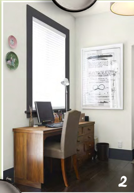
Resene Double Black White