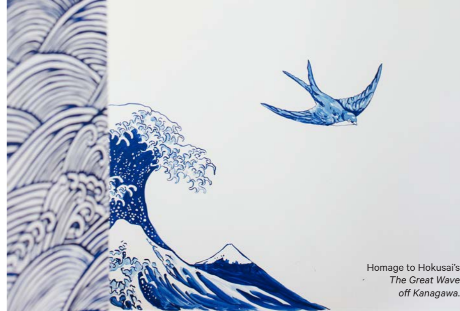
Homage to Hokusai's The Great Wave off Kanagawa.