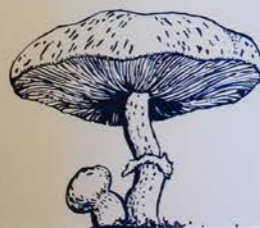
One of the mushrooms that we like to eat