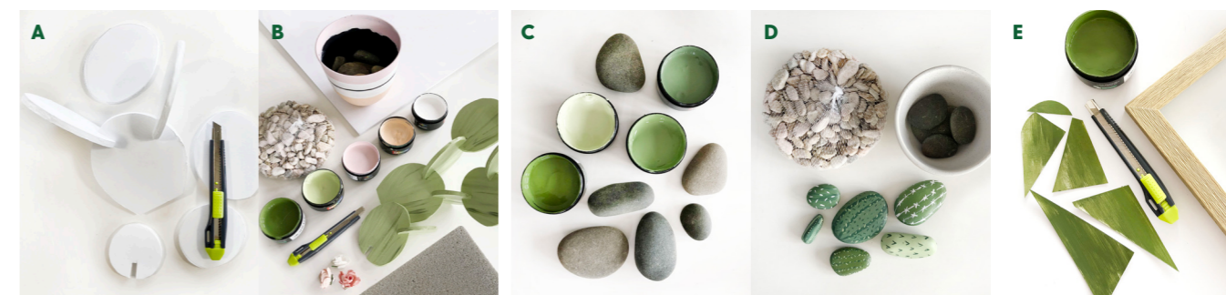
BACKGROUND PAINTED IN RESENE SAKURA.