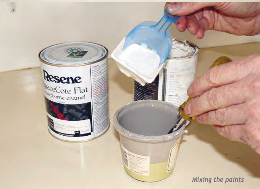
Mixing the paints