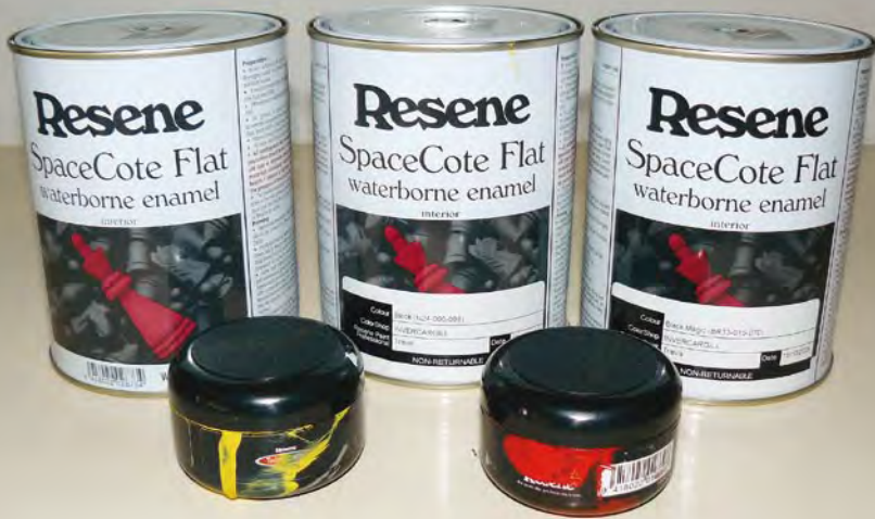
The paints needed