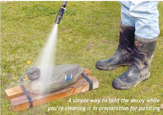
A simple way to hold the decoy while you're cleaning it in preparation for painting

Now the main reason why we need to spend some of our good summer days painting decoys, is that once they are painted, we need a good hot, sunny day to bake the paint on. As matt paints are not that durable, it is important to do this. If we were to paint them only a week or two before duck season in cool weather, the paint will not dry or harden properly and will simply rub off. Sit your decoys out on a couple of good hot, sunny days and bake that paint on!