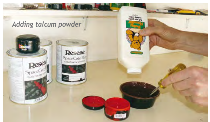
Adding talcum powder