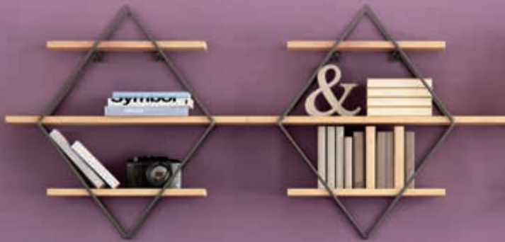
SOFT SELECTION Clockwise (from bottom left): Resene Alluring; Resene London Hue; Resene Fog; Resene Essence; Resene Balance.

If you're planning to use lavender on all walls in a room, choose a muddied shade.