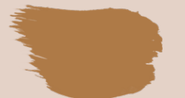
Resene Swiss Caramel