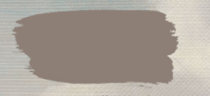
Resene Coffee Break