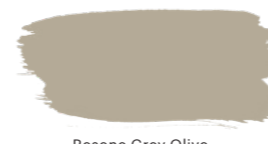
Resene Grey Olive