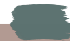
Resene Green Meets Blue

Photograph of Casa de Verano: Luis Carbonell, courtesy of Ricardo Bofill Taller de Arquitectura