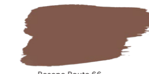
Resene Route 66