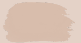
Resene Shabby Chic

For this effect, the geometric appeal of quilted creations by New York textile designer Thompson Street Studio meets the symmetrical pleasure of weaving and wicker in colours that echo sweet tooth's can't-say-no flavours: nougat, caramel and chocolate.