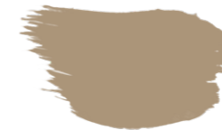
Resene Colins Wicket