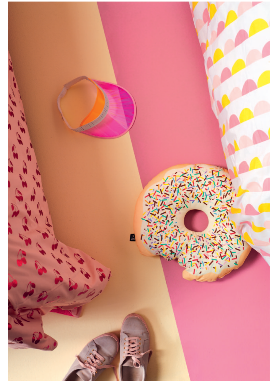
OPPOSITE Wall in Resene SpaceCote Low Sheen in Resene Quarter Moonbeam and Resene Turkish Delight, prepped with Resene Quick Dry and sealed with Resene Uracryl GraffitiShield Clear, resene.co.nz. LEFT String Ball lights by Lummi & Co, $62, ikoiko.co.nz. Cherry Pie duvet cover by Kip & Co, $199/king single; Velvet pillowcase (pink) by Kip & Co, $85/pair; Pea cushion (yellow) by Kip & Co, $99; Mosaic Linen cushion by Bonnie and Neil, $165; Zebby baby blanket by Kip & Co, $109, collected.co.nz. MIDDLE Bedboy bedside table, $930, timwebberdesign.com. Cactus light by Heico, $199, greyandwild.com. Rainbow stacker by One Two Tree, $55, teapea.co.nz. Rice cup, $13, ikoiko.co.nz. Starry Night night light by Eef Lillemor, $25; Flora and the Flamingo book by Molly Idle, $35, greyandwild.com. RIGHT Duvet by Scout, $235/king single set; Marita pillowcase (striped) by Sage & Clare, $45, teapea.co.nz. Hattarakukka cushion cover (multicoloured), $60, boltofcloth.com. Puss Pea cushion by Kip & Co, $99, collected.co.nz. Sun visor by Sunnylife, $17, ikoiko.co.nz. Sheets stylist's own. THIS PAGE Krispy Dreme donut cushion by Sack Me!, $60, greyandwild.com. Shoes stylist's own.

Encourage a harmonious shared space by personalising a side of the bedroom to suit each child. When pairing paint colours to divide a room in half, create interest by teaming a lighter and a bolder shade, and when making your selection, be sure to view the swatches side by side, as the hues need to work together. As well as choosing shades of different strengths, sticking to a palette of all warm – or all cool tones will make for a compelling contrast without being too jarring. Aim to continue the colour theme in your soft furnishing and accessories.