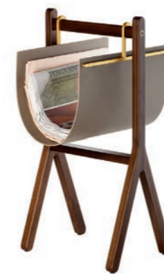
Ren side table from STUDIO ITALIA.