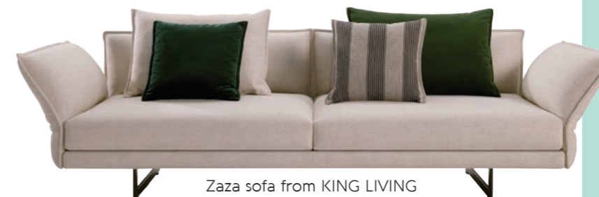
Zaza sofa from KING LIVING