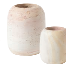
Asili soapstone vessels from CITT