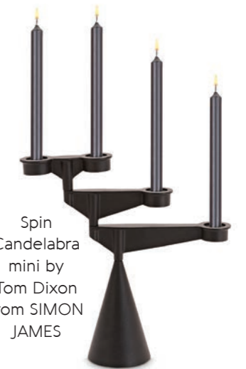
Spin Candelabra mini by Tom Dixon from SIMON JAMES