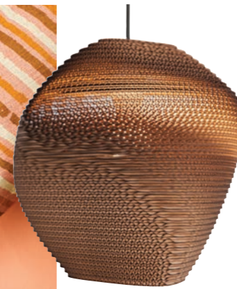
Allyn Pendant in natural by Graypants from ECC