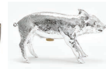
Reality Bank in the Form of a Pig by Areaware, from WORLD.