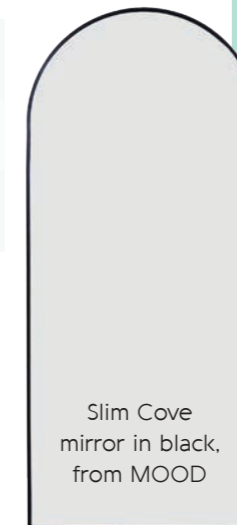
Slim Cove mirror in black, from MOOD