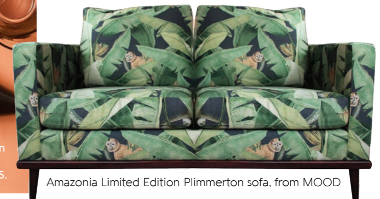
Amazonia Limited Edition Plimmerton sofa, from MOOD