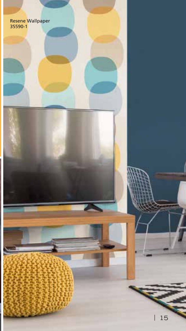
Resene Wallpaper 35590-1