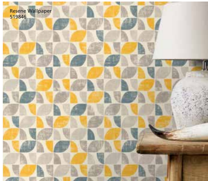
Resene Wallpaper 519846

With every great architectural movement, there's a wallpaper style to match. Jazz up your home with some Art Deco-style geometric, fan or diamond patterns and capture the vigour of the roaring 20s. Go bold with a mid-century bright pattern or channel the ornate romance of Art Nouveau. If your home is built in a strong architectural style, matching your home's interior to the architecture is a way of making the space feel more cohesive. Alternatively, work with the home's construction style to accentuate aspects of the design – horizontal patterns that stretch across a wall will elongate the room. Try something different and wallpaper columns and beams to create an impact.