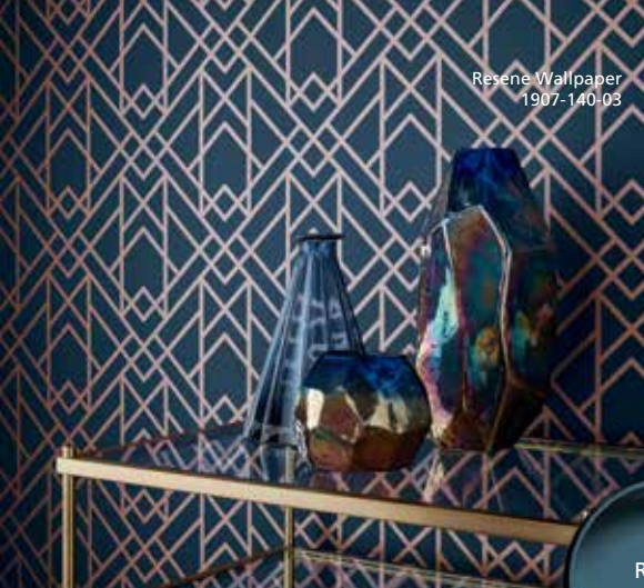
Resene Wallpaper 1907-140-03