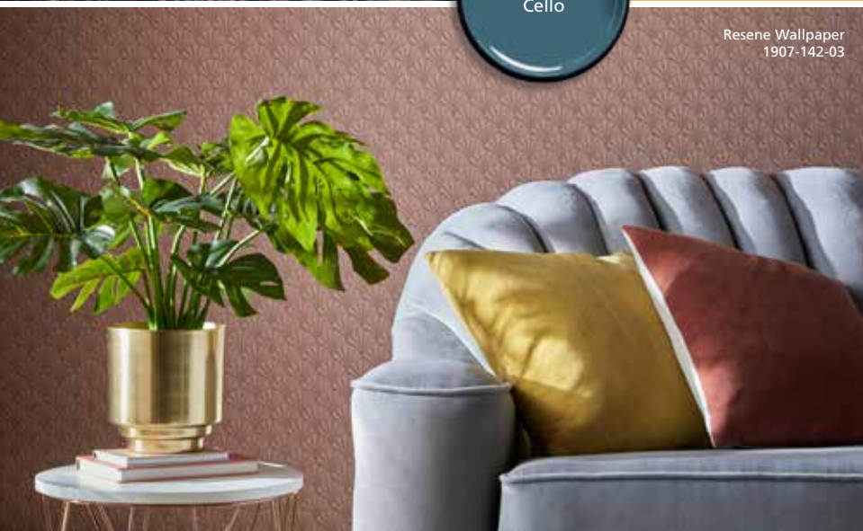
Resene Wallpaper 1907-142-03