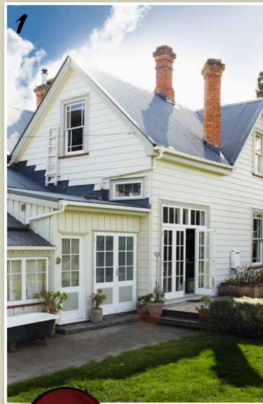
Resene Red Planet

4 Reliable Resene Grey Friars appears again on the roof in this scheme but this time as part of a very effective shades-of-grey combo, complemented by Resene Gull Grey , a simple, uncomplicated pastel, on the weatherboards. Resene Quarter Tuna takes its place on the fascia board, window sills and ladder, adding an air of steely resolve, then gentle white Resene Half Barely There arrives to soften any hard edges, appearing on the eaves, the windows and the french doors.